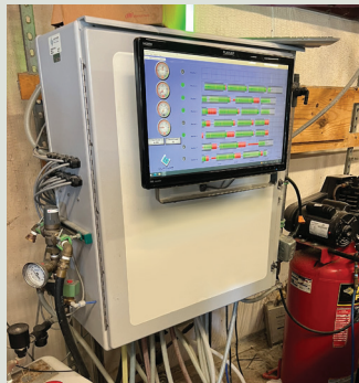
EXAMPLES OF OUR CONTROL DEVICES IN ACTION.

With over 60 locations across North America we provide a cohesive system of support to your operation. A ChemStation Manufacturing Center is within 100 miles of your facility.